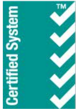
Environment ISO 14001

Dominant is committed to delivering high-quality products with consistent and reliable performance. That is why we have implemented and maintain management systems that exceed the requirements of International ISO standards. Allowing you to have confidence when using all Dominant products and services.