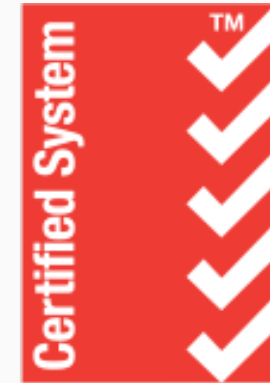
Food Safety ISO 22000

ISO 9001 is a standard that sets out the requirements for a quality management system. Dominant is certified to the ISO9001:2015 standard for the development, manufacture, and despatch of cleaning chemicals and personal care products.