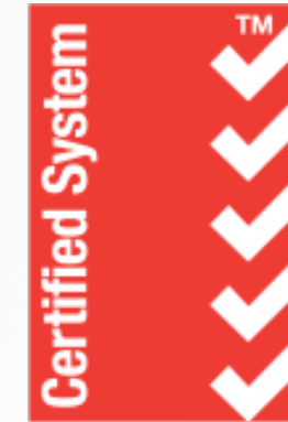
Food Safety CODEX HACCP

ISO 22000 ensures the safety of the global food supply chain to the highest standard. It is an internationally recognised certification standard based on the most advanced technological, scientific, and managerial expertise. This certification has created a level standard across food safety management systems worldwide.