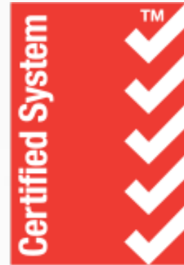
Quality ISO 9001

Dominant is proudly certified to the ISO 14001 Environmental Management Standard. This environmental management system ensures the company interacts responsibly with the environment across all aspects of the business.