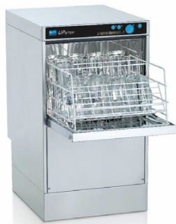
▶ Meiko Glasswasher U400