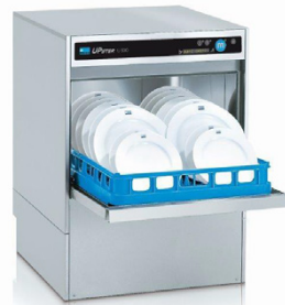
▶ Meiko Undercounter Dishwasher U500