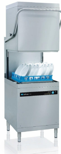
▶ Meiko Pass-Through Dishwasher