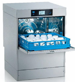
▶ Meiko Glasswasher M-iClean