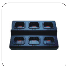
6 Slot Charger